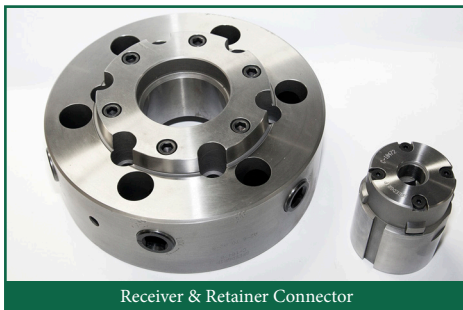
Receiver & Retainer Connector

A simple and cost effective way to "Adapt to Change"