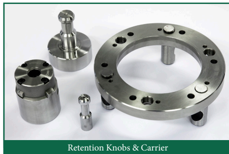
Retention Knobs & Carrier