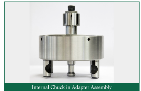
Internal Chuck in Adapter Assembly