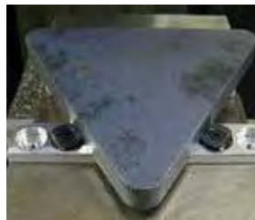
Odd shaped parts