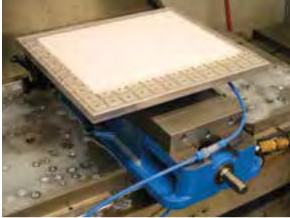
VM100 Base Unit (45375) with VM300 Vacuum Pallet (45150)