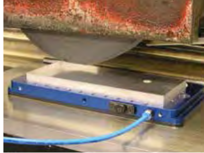
VM100 Base Unit (45375) on a Magnetic Chuck