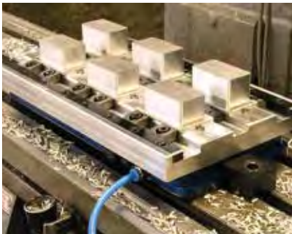
VM100 Base Unit (45375) with a Production Pallet (VM100 Blank Pallet - 45325)