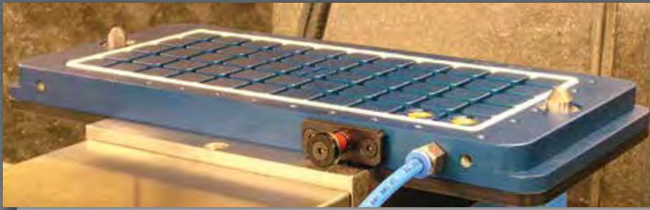
VM100 Base Unit (45375) in Vise