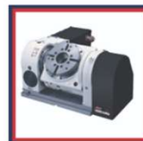
Rotary Table Units