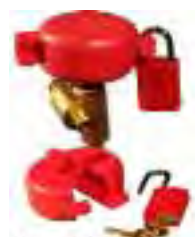
Mixer Lockout #MIXXLock

Dimac Tooling Pty Ltd 61-65 Geddes St Mulgrave Vic 3170 Freecall: 1800-335-272 Phone: 61 3 9561 6155 Fax: 61 3 9561 6705 Web: www.dimac.com.au