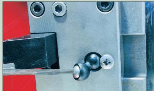
BugEye shown installed on CNC turning center.

Ordering Information: Measure the diameter of the original ball in your machine and order the nominal diameter to suit.